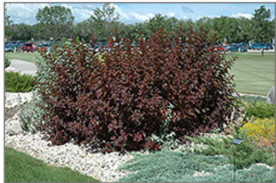
Diablo Ninebark