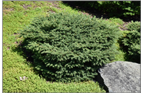
Birds Nest Spruce