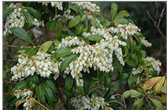
Red Mill Japanese Pieris flowers

Red Mill Japanese Pieris is recommended for the following landscape applications;