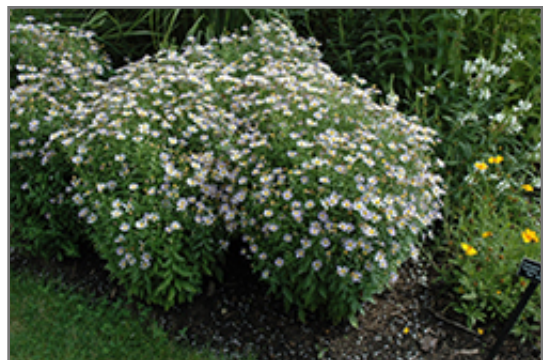
Blue Star Japanese Aster in bloom