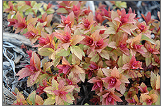
Magic Carpet Spirea foliage

Magic Carpet Spirea will grow to be about 24 inches tall at maturity, with a spread of 3 feet. It tends to fill out right to the ground and therefore doesn't necessarily require facer plants in front. It grows at a fast rate, and under ideal conditions can be expected to live for approximately 20 years.