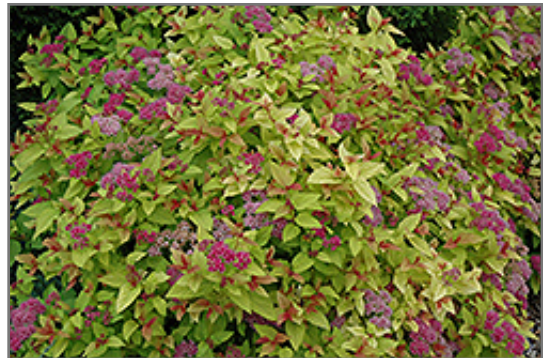
Magic Carpet Spirea flowers