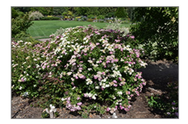
Shirobana Spirea in bloom

Shirobana Spirea is recommended for the following landscape applications;