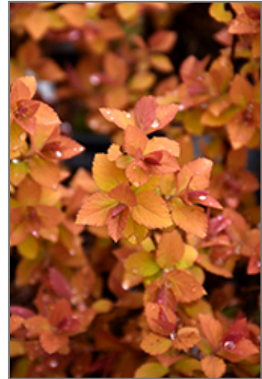
Double Play Big Bang Spirea foliage

This shrub should only be grown in full sunlight. It prefers to grow in average to moist conditions, and shouldn't be allowed to dry out. It is not particular as to soil type or pH. It is highly tolerant of urban pollution and will even thrive in inner city environments. This particular variety is an interspecific hybrid.