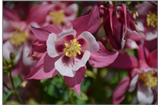
Origami Rose and White Columbine flowers

Origami Rose and White Columbine is recommended for the following landscape applications;