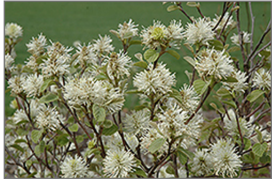
Dwarf Fothergilla flowers

This shrub does best in full sun to partial shade. It requires an evenly moist well-drained soil for optimal growth, but will die in standing water. It is not particular as to soil type, but has a definite preference for acidic soils, and is subject to chlorosis (yellowing) of the foliage in alkaline soils. It is somewhat tolerant of urban pollution. This species is native to parts of North America.