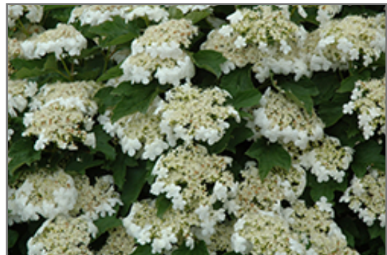
Compact European Cranberry flowers