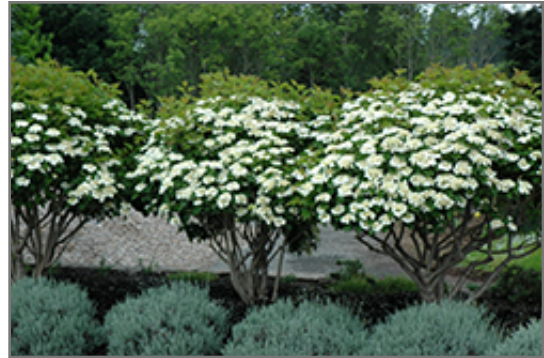
Compact European Cranberry in bloom

Compact European Cranberry is a dense multi-stemmed deciduous shrub with a more or less rounded form. Its average texture blends into the landscape, but can be balanced by one or two finer or coarser trees or shrubs for an effective composition.