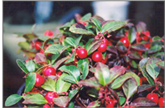
Creeping Wintergreen fruit