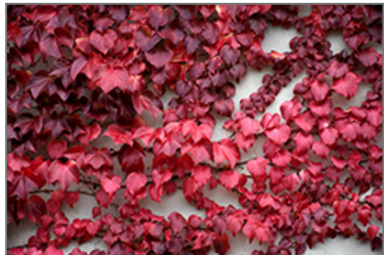
Veitch Boston Ivy in fall