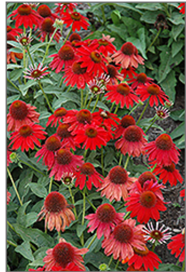
Sombrero Salsa Red Coneflower flowers

This is a relatively low maintenance plant, and is best cleaned up in early spring before it resumes active growth for the season. It is a good choice for attracting butterflies to your yard, but is not particularly attractive to deer who tend to leave it alone in favor of tastier treats. It has no significant negative characteristics.