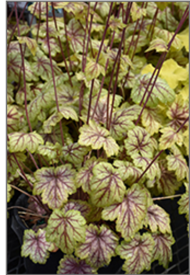
Circus Coral Bells foliage

Circus Coral Bells is recommended for the following landscape applications;