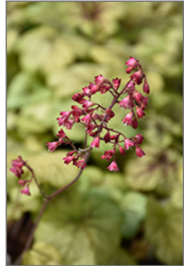
Circus Coral Bells flowers

Circus Coral Bells is a fine choice for the garden, but it is also a good selection for planting in outdoor pots and containers. With its upright habit of growth, it is best suited for use as a 'thriller' in the 'spiller-thriller-filler' container combination; plant it near the center of the pot, surrounded by smaller plants and those that spill over the edges. Note that when growing plants in outdoor containers and baskets, they may require more frequent waterings than they would in the yard or garden.