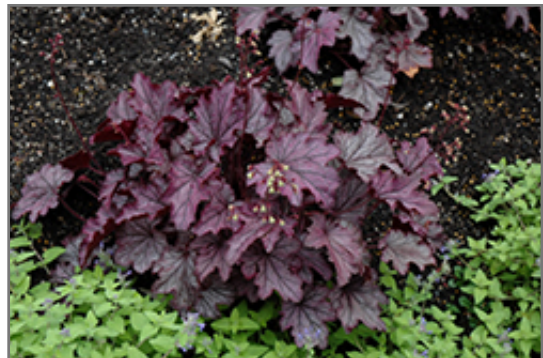
Spellbound Coral Bells