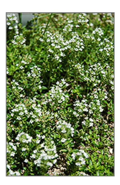
White Moss Thyme flowers

A spectacular and very durable groundcover, forming a dense low mat completely covered in snow white flowers throughout summer, attractive fine and very fragrant foliage the rest of the season; needs a dry and sunny location, can take light foot traffic