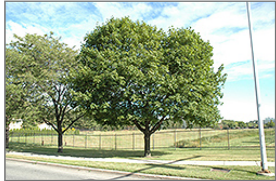
Norway Maple