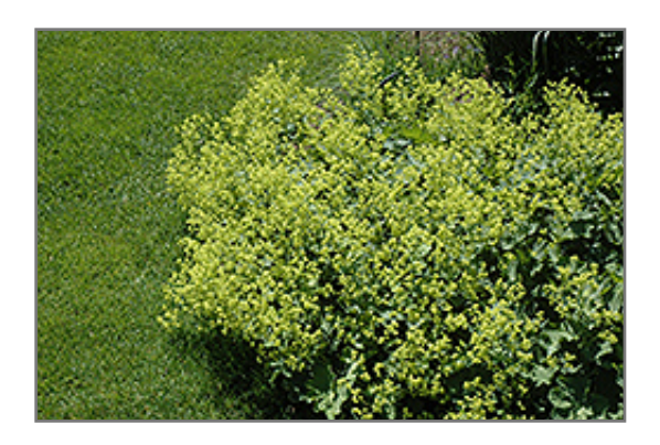
Lady's Mantle in bloom