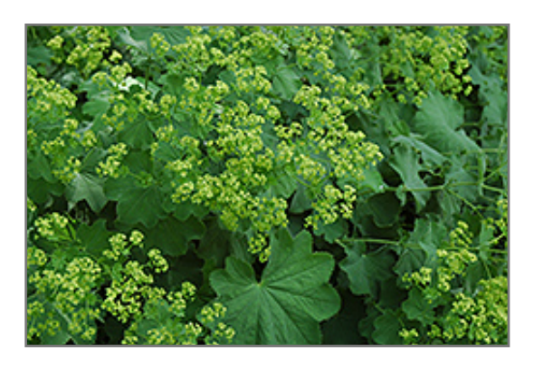
Lady's Mantle flowers

Lady's Mantle is recommended for the following landscape applications;