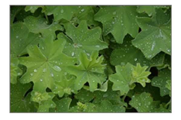
Lady's Mantle foliage

Lady's Mantle will grow to be about 18 inches tall at maturity, with a spread of 18 inches. Its foliage tends to remain dense right to the ground, not requiring facer plants in front. It grows at a medium rate, and under ideal conditions can be expected to live for approximately 10 years. As an herbaceous perennial, this plant will usually die back to the crown each winter, and will regrow from the base each spring. Be careful not to disturb the crown in late winter when it may not be readily seen!