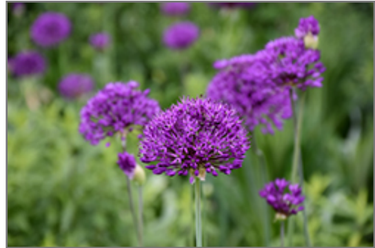
Purple Sensation Ornamental Onion flowers

Purple Sensation Ornamental Onion will grow to be about 12 inches tall at maturity extending to 3 feet tall with the flowers, with a spread of 12 inches. It grows at a medium rate, and under ideal conditions can be expected to live for approximately 5 years. As this plant tends to go dormant in summer, it is best interplanted with late-season bloomers to hide the dying foliage.