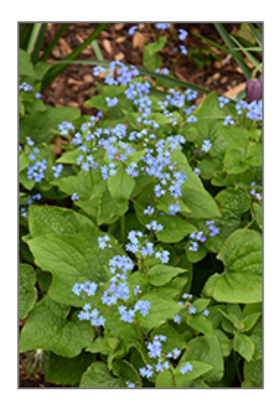
Siberian Bugloss flowers

This is a relatively low maintenance plant, and should be cut back in late fall in preparation for winter. It has no significant negative characteristics.