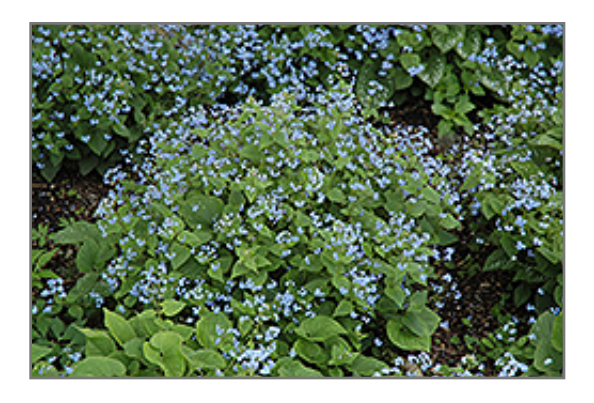
Siberian Bugloss in bloom

Siberian Bugloss is recommended for the following landscape applications;