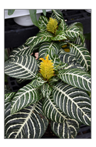
Zebra Plant in bloom

When grown indoors, Zebra Plant can be expected to grow to be about 24 inches tall at maturity extending to 3 feet tall with the flowers, with a spread of 24 inches. It grows at a medium rate, and under ideal conditions can be expected to live for approximately 10 years. This houseplant should only be grown away from direct sunlight or in a room with strong artificial light. It prefers to grow in average to moist soil. The surface of the soil shouldn't be allowed to dry out completely, and so you should expect to water this plant once and possibly even twice each week. Be aware that your particular watering schedule may vary depending on its location in the room, the pot size, plant size and other conditions; if in doubt, ask one of our experts in the store for advice. It is not particular as to soil type or pH; an average potting soil should work just fine.