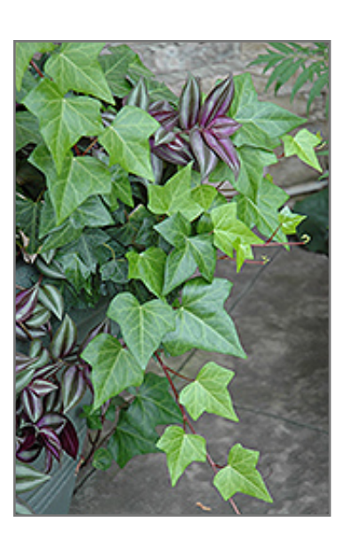
Algerian Ivy foliage

When grown indoors, Algerian Ivy can be expected to grow to be about 10 feet tall at maturity, with a spread of 3 feet. It grows at a fast rate, and under ideal conditions can be expected to live for approximately 30 years. This houseplant performs well in both bright or indirect sunlight and strong artificial light, and can therefore be situated in almost any well-lit room or location. It is very adaptable to both dry and moist soil, and should do just fine under average home conditions. The surface of the soil shouldn't be allowed to dry out completely, and so you should expect to water this plant once and possibly even twice each week. Be aware that your particular watering schedule may vary depending on its location in the room, the pot size, plant size and other conditions; if in doubt, ask one of our experts in the store for advice. It is not particular as to soil pH, but grows best in rich soil. Contact the store for specific recommendations on pre-mixed potting soil for this plant. Be warned that parts of this plant are known to be toxic to humans and animals, so special care should be exercised if growing it around children and pets.