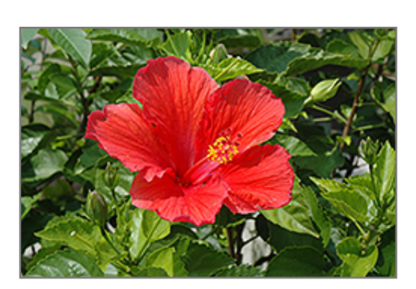
Red Hibiscus flowers