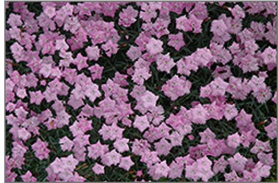
Bath's Pink Pinks in bloom

Bath's Pink Pinks is recommended for the following landscape applications;