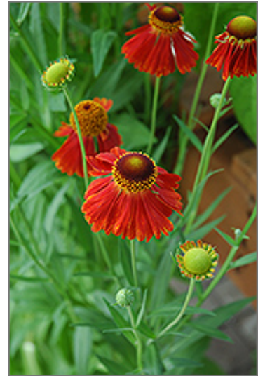
Moerheim Beauty Sneezeweed flowers