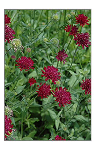
Crimson Scabious flowers

Crimson Scabious will grow to be about 24 inches tall at maturity extending to 3 feet tall with the flowers, with a spread of 24 inches. It tends to be leggy, with a typical clearance of 1 foot from the ground, and should be underplanted with lower-growing perennials. It grows at a fast rate, and under ideal conditions can be expected to live for approximately 3 years. As an herbaceous perennial, this plant will usually die back to the crown each winter, and will regrow from the base each spring. Be careful not to disturb the crown in late winter when it may not be readily seen!