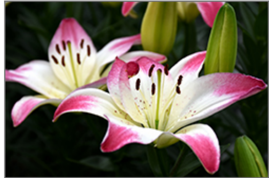
Lollypop Lily flowers