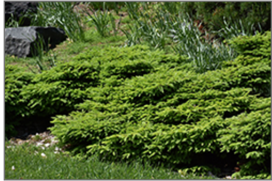
Little Gem Spruce

This shrub does best in full sun to partial shade. It does best in average to evenly moist conditions, but will not tolerate standing water. It is not particular as to soil type or pH, and is able to handle environmental salt. It is highly tolerant of urban pollution and will even thrive in inner city environments. This is a selected variety of a species not originally from North America.