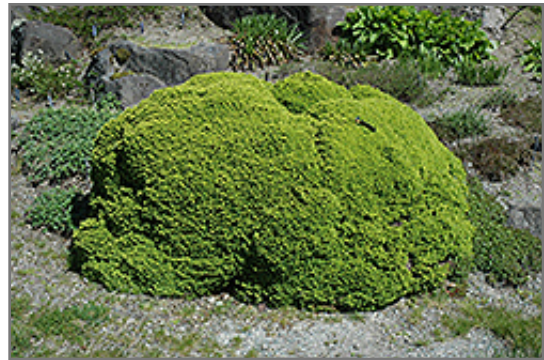
Little Gem Spruce

Little Gem Spruce is recommended for the following landscape applications;