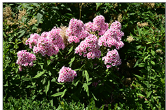
Bright Eyes Garden Phlox in bloom