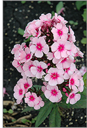
Bright Eyes Garden Phlox flowers

Bright Eyes Garden Phlox is a fine choice for the garden, but it is also a good selection for planting in outdoor pots and containers. With its upright habit of growth, it is best suited for use as a 'thriller' in the 'spiller-thriller-filler' container combination; plant it near the center of the pot, surrounded by smaller plants and those that spill over the edges. It is even sizeable enough that it can be grown alone in a suitable container. Note that when growing plants in outdoor containers and baskets, they may require more frequent waterings than they would in the yard or garden.