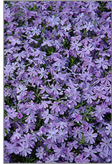
Emerald Blue Moss Phlox flowers

Emerald Blue Moss Phlox is recommended for the following landscape applications;