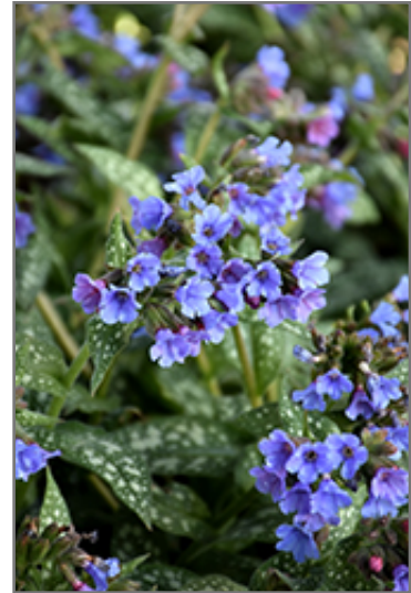
Trevi Fountain Lungwort flowers