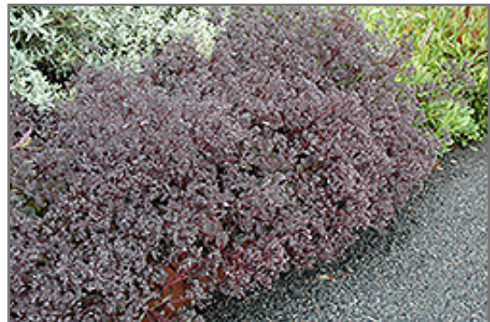
Bertram Anderson Stonecrop