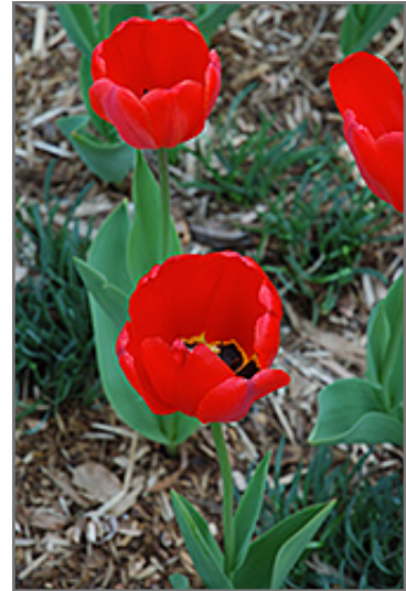
Parade Tulip flowers