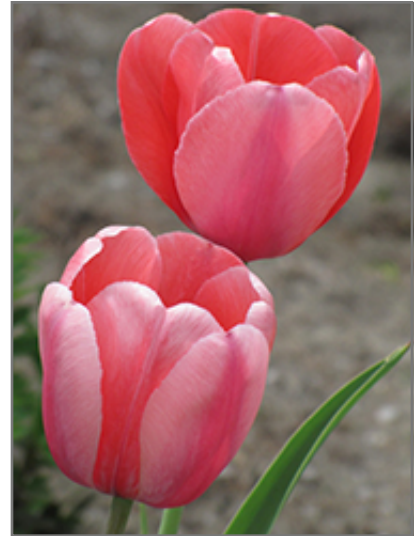
Pink Impression Tulip flowers