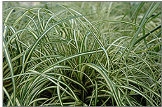
Evergold Variegated Japanese Sedge foliage

Evergold Variegated Japanese Sedge is recommended for the following landscape applications;