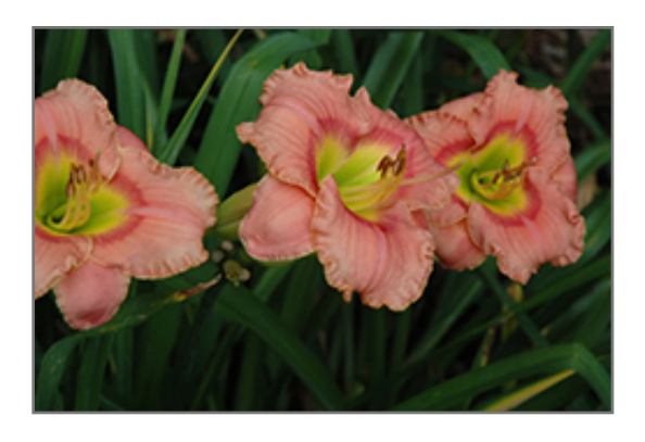
Elegant Candy Daylily flowers