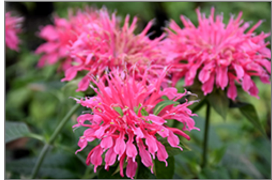
Coral Reef Beebalm flowers

Coral Reef Beebalm is recommended for the following landscape applications;