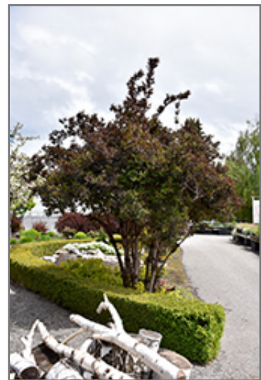
Black Beauty Elder