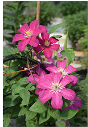
Barbara Harrington Clematis flowers