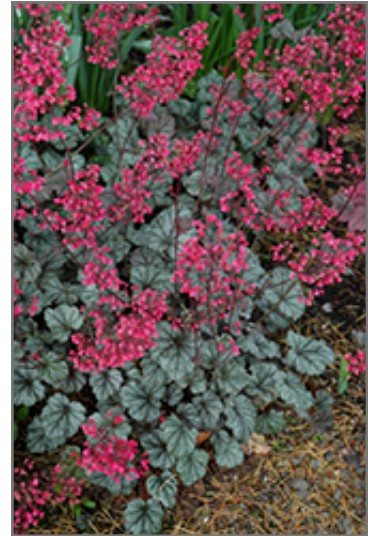
Rave On Coral Bells in bloom

Rave On Coral Bells is recommended for the following landscape applications;