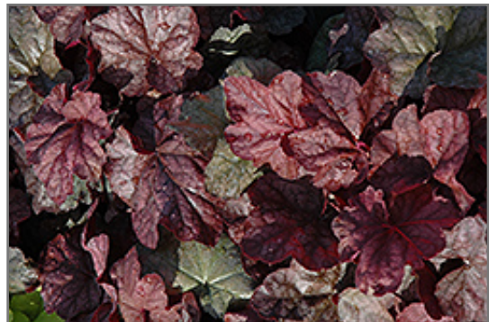
Beaujolais Hairy Alumroot foliage