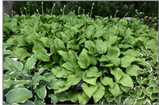
Royal Standard Hosta

Royal Standard Hosta is recommended for the following landscape applications;