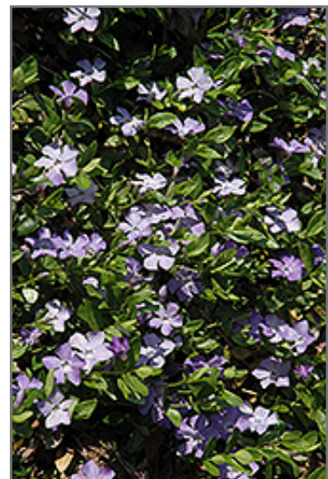
Common Periwinkle in bloom