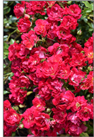
Red Drift Rose flowers

Red Drift Rose is recommended for the following landscape applications;