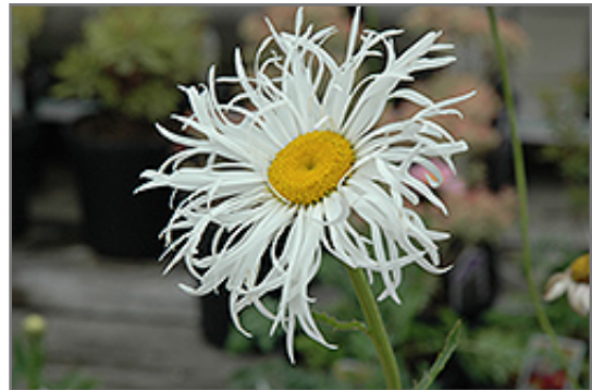
Aglaia Shasta Daisy flowers