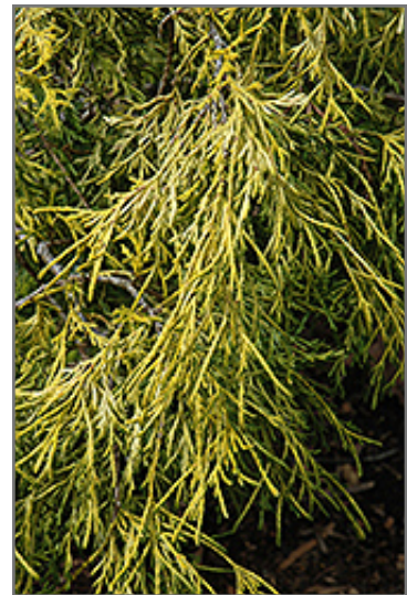
Lemon Thread Falsecypress foliage