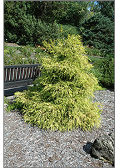
Lemon Thread Falsecypress

Lemon Thread Falsecypress is recommended for the following landscape applications;