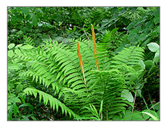
Cinnamon Fern in bloom