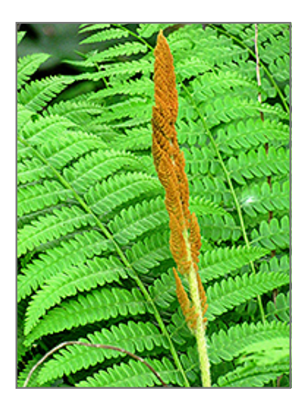
Cinnamon Fern flowers

Cinnamon Fern is recommended for the following landscape applications;