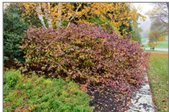
Bailey Red-Twig Dogwood in fall