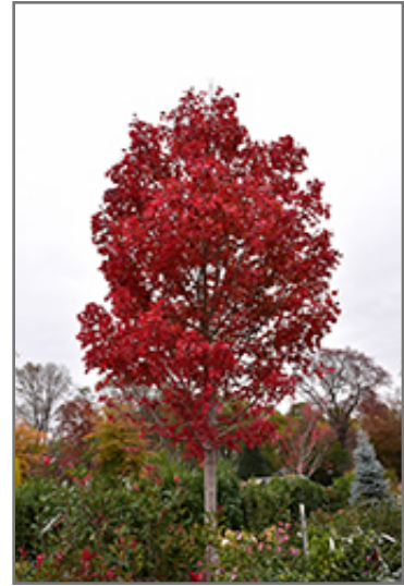
October Glory Red Maple in fall