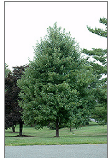
October Glory Red Maple