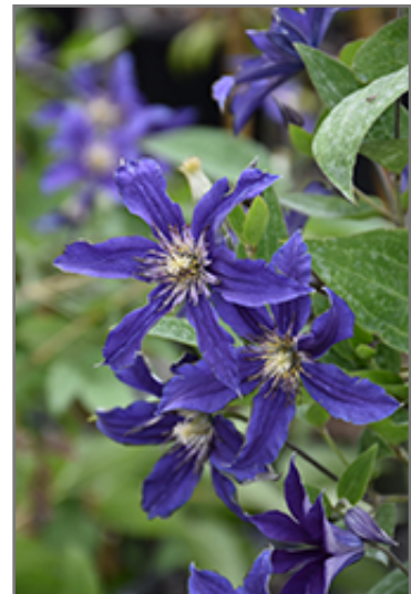
Sapphire Indigo Clematis flowers